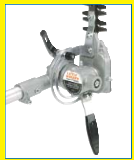
Adjust blade to any angle up to 180° with quick release lever.